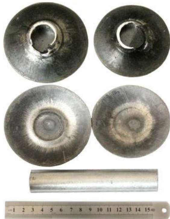
Fig. 2 Initial billet of AM60 and dish-shaped samples fabricated by spread extrusion.

Both the initial and final samples of AM60 magnesium alloy before and after the spread extrusion process are depicted in Fig. 2. It clearly shows that this process can produce samples in which cylindrical billets changed to the final dish-shaped samples.